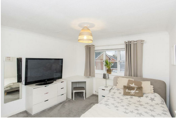
Bedroom Two 13'1" x 11'5" (3.99m x 3.48m)

UPVC double-glazed window to front. Built in wardrobe. Radiator.