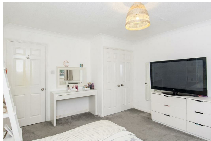
Bedroom Three 11'2" x 9'1" (3.40m x 2.77m)

UPVC double-glazed window to front. Built in wardrobe. Radiator.