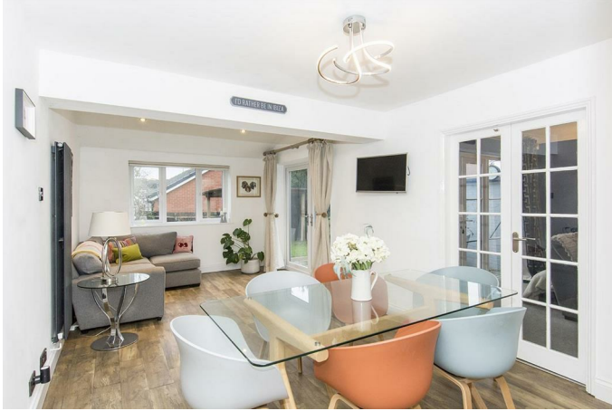
Living/Dining Room 20'2" x 10'4" (6.15m x 3.15m )

UPVC double-glazed window to rear. UPVC double-glazed French doors to side. Glazed French doors through to lounge. Radiator.