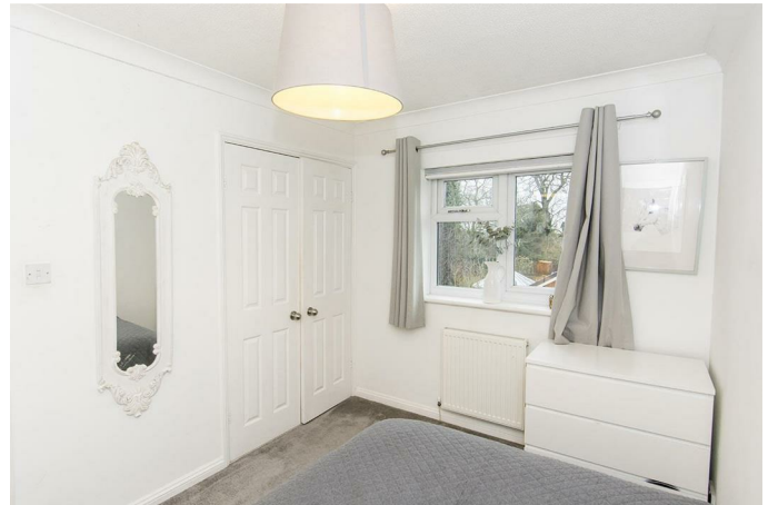
Bedroom Four 10'4" x 8'0" to wardrobe doors (3.15m x 2.44m to wardrobe doors)

UPVC double-glazed window to rear. Built in wardrobe. Radiator.